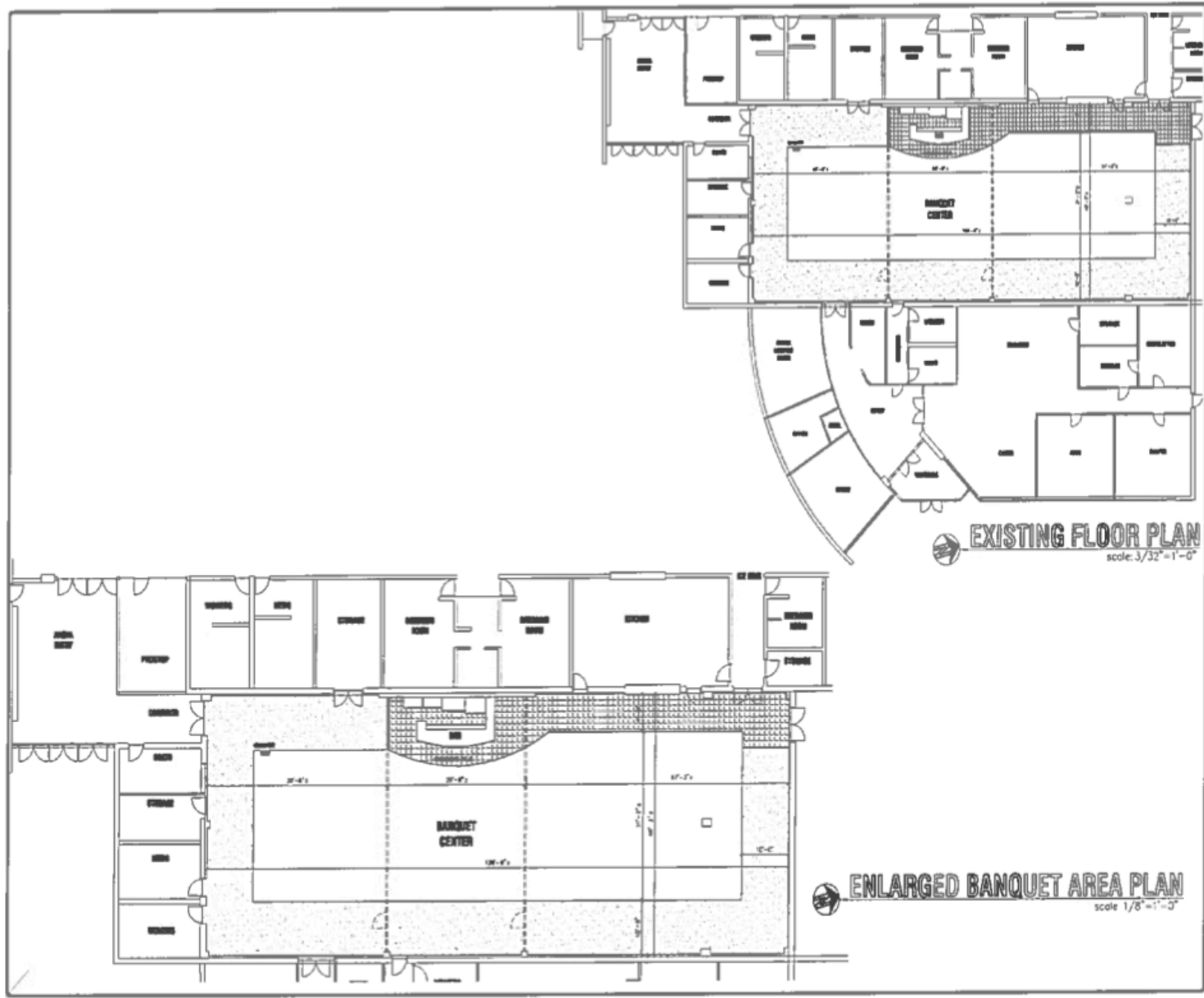
EXISTING FLOOR PLAN scale: 3/32" = 1'-0"